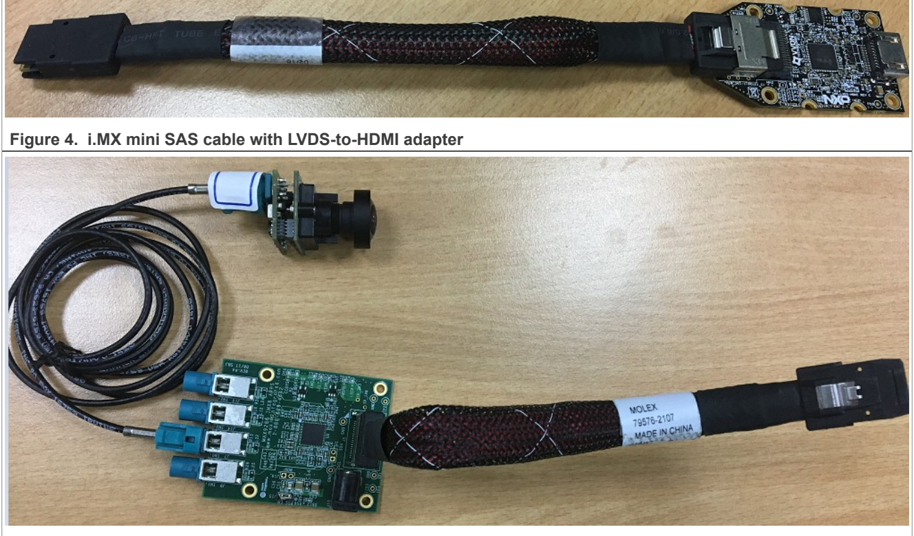
Figure 5. i.MX rearview camera (MAX9286)