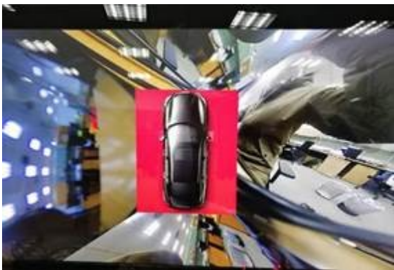
Figure 3. All cameras' views on the display