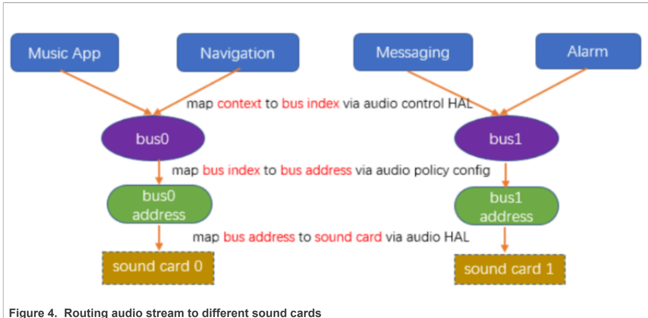
Figure 4. Routing audio stream to different sound cards