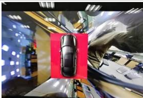
Figure 3. All cameras' views on the display